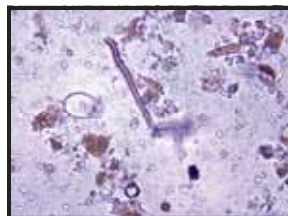
Amoeba and Fungi